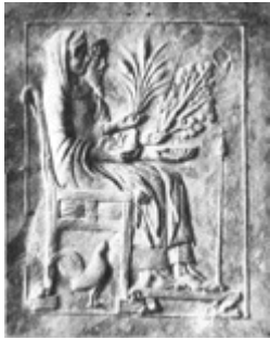
Persephone and Hades on the throne.