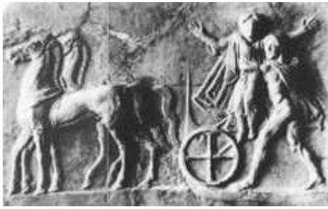
The abduction of Persephone.